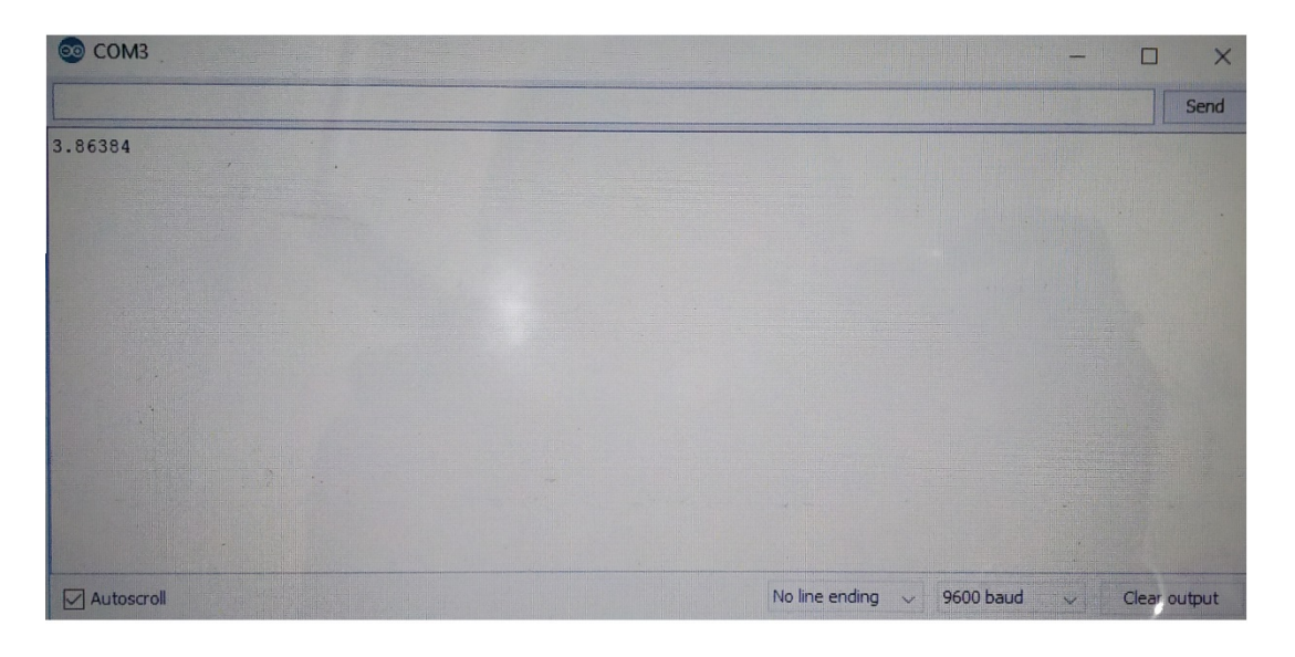
Fig.3. The Battery percentage is above threshold value (voltage value is displayed)